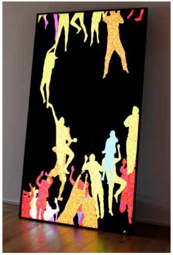
© Daniel Canogar, Courtesy of bitforms gallery, New York