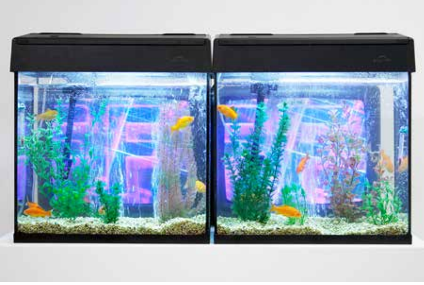
© Nam June Paik, Courtesy of Carl Solway Gallery