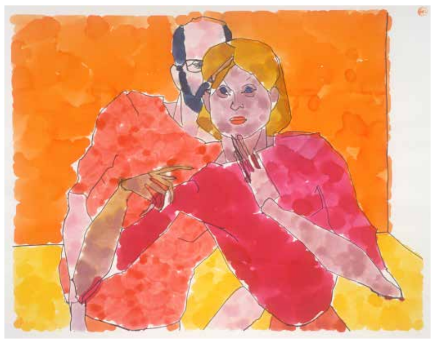
© Harold Cohen