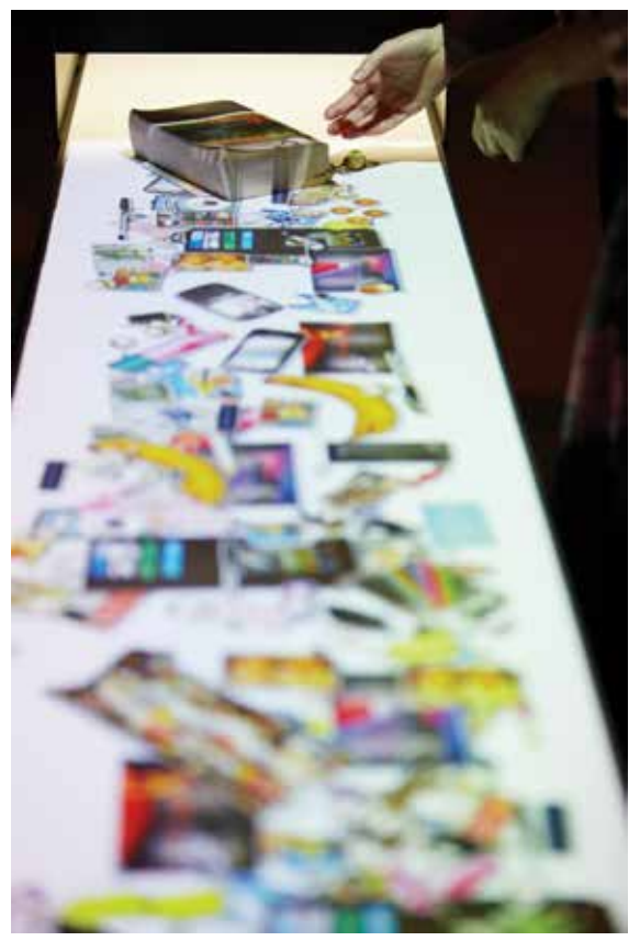
© Rafael Lozano-Hemmer