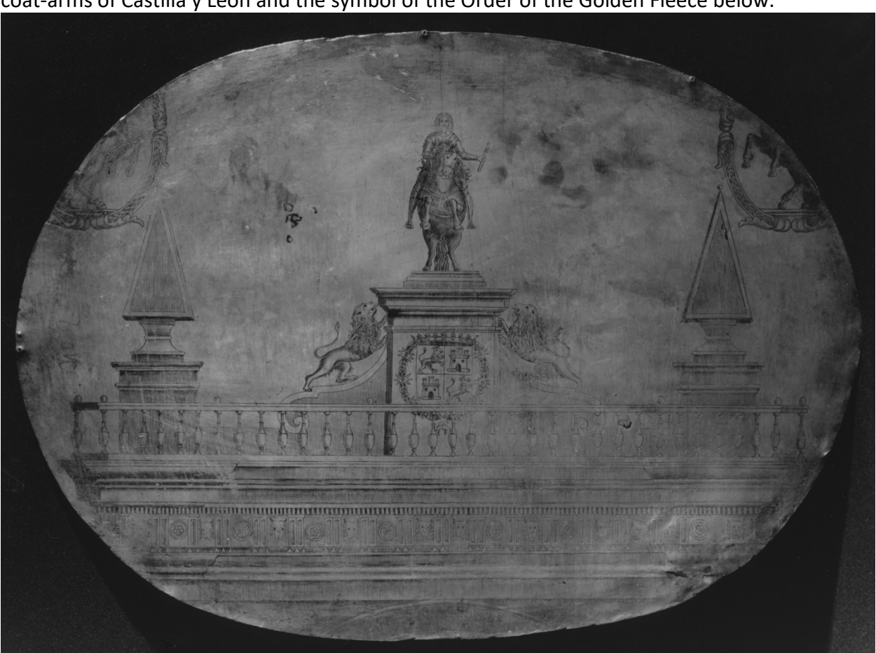
Fig. 1 Reverse of The Christ Child Appearing to Saint Anthony of Padua

On the reverse of The Christ Child Appearing to Saint Anthony of Padua is the upper portion of an engraving (fig. 1) representing an equestrian figure of the Spanish king Philip V on a flat platform with a balustrade, beneath which is an entablature with classical decoration, and below a remnant of what appears to be a triumphal arch. The pedestal is decorated with the coat-arms of Castilla y León and the symbol of the Order of the Golden Fleece below.