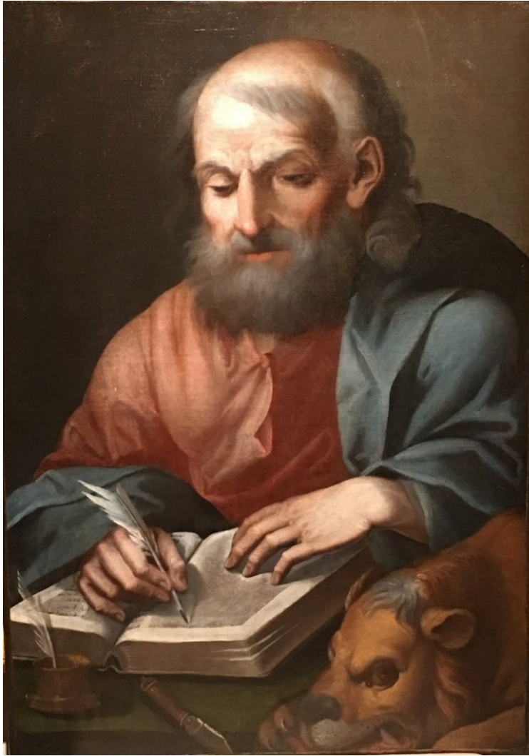
2018.004 Melchor Pérez Holguín (c. 1660-1732) Bolivia, Potosí Saint Mark Ca. 1714 Oil on canvas, 30 ½ x 21 ¼ inches