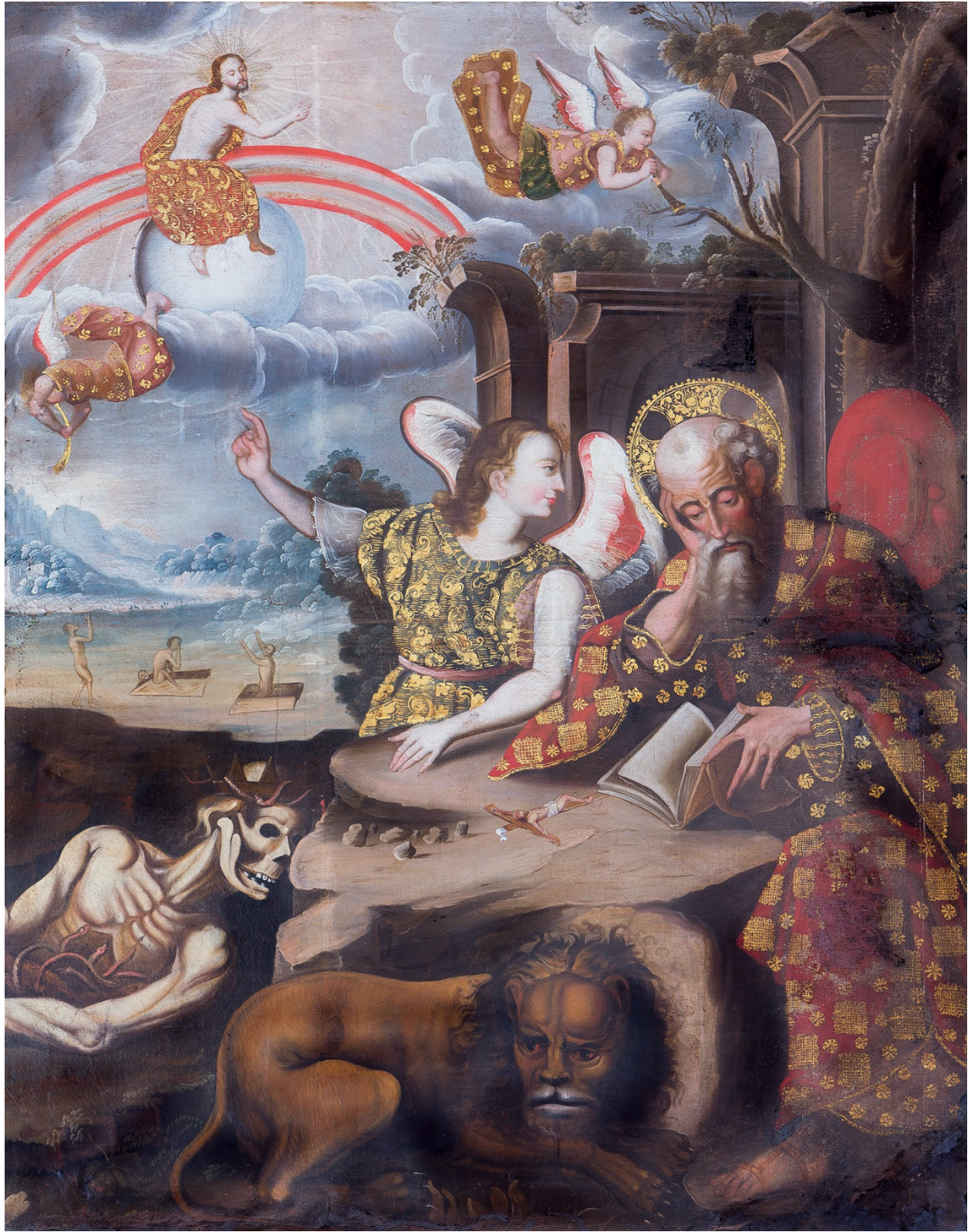
Fig. 3. Unidentified Artist. Saint Jerome Meditating on the Four Last Things . Eighteenth century. Oil on canvas, dimensions unknown. Church of Nuestra Señora de Belén, Cuzco.