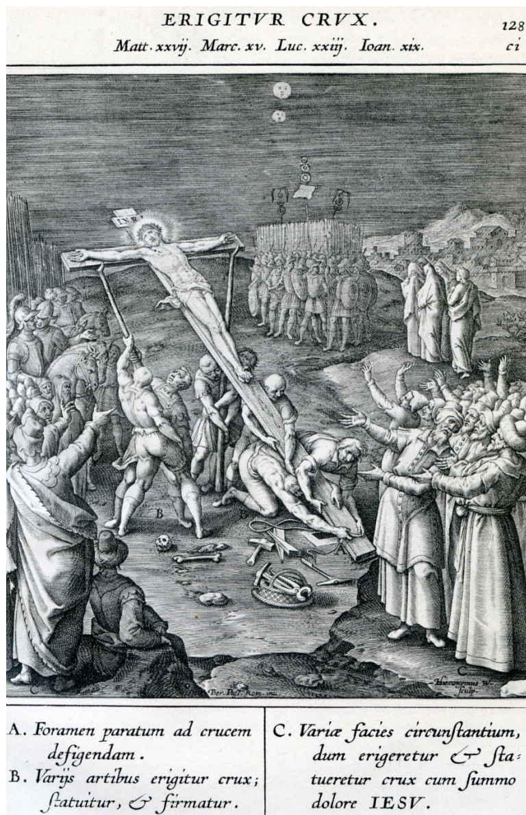
Fig. 1. Erigitur crux. Engraving in Jerónimo Nadal's Meditations and Annotations on the Gospels . First published in Antwerp in 1595.