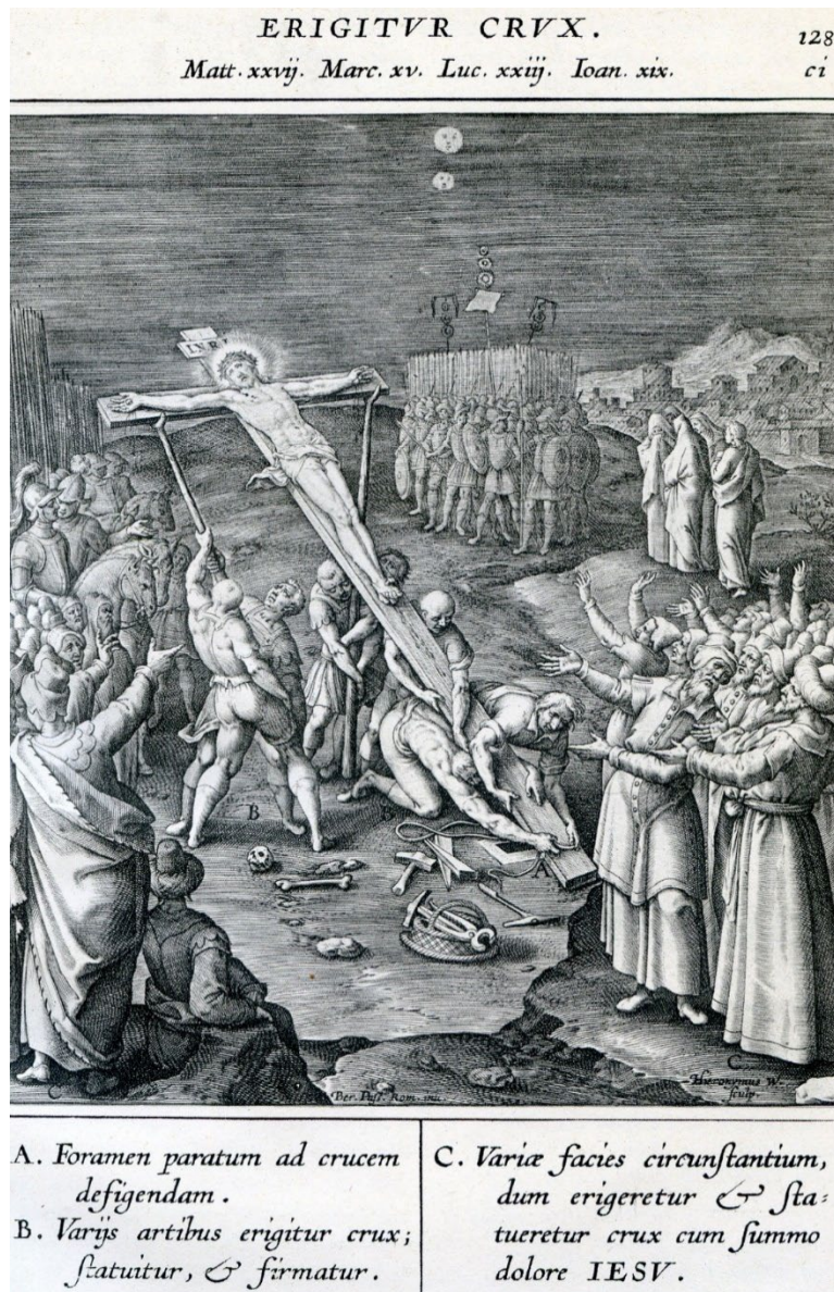
Fig. 1. Erigitur crux . Engraving in Jerónimo Nadal's Meditations and Annotations on the Gospels . First published in Antwerp in 1595.

The viceregal artist might have been familiar with other graphic sources for this composition as well, or even referenced an imported European painting. This multifigured composition with grieving women, soldiers and horses milling around, and even several figures throwing dice to claim Christ's robe was not uncommon in European paintings preceding the possible date of this work.